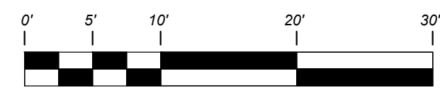
GRAPHIC SCALE IN FEET 1"=10'