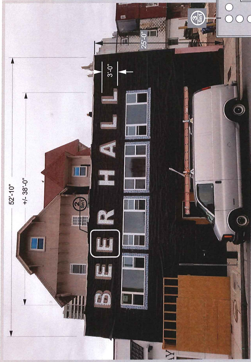
① FRONT ELEVATION: FROM TENNESSEE AVE. (N.T.S.)