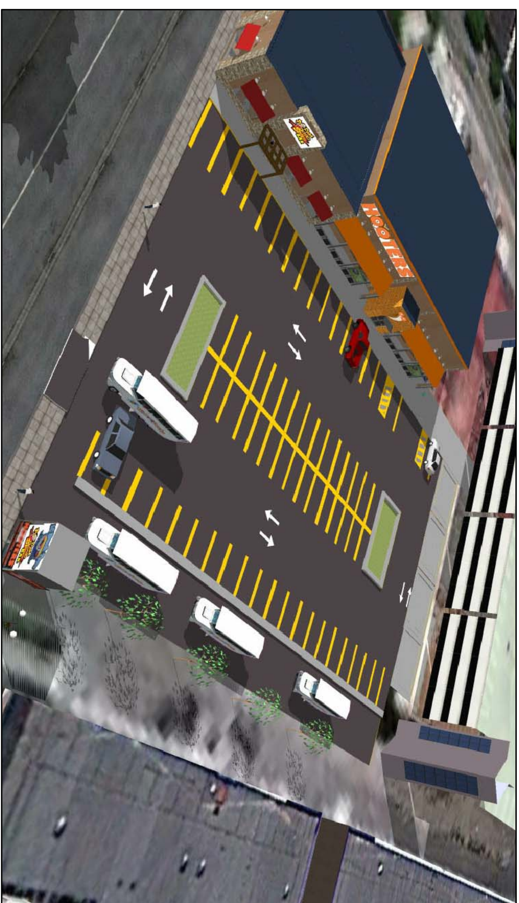
ARIAL SE VIEW