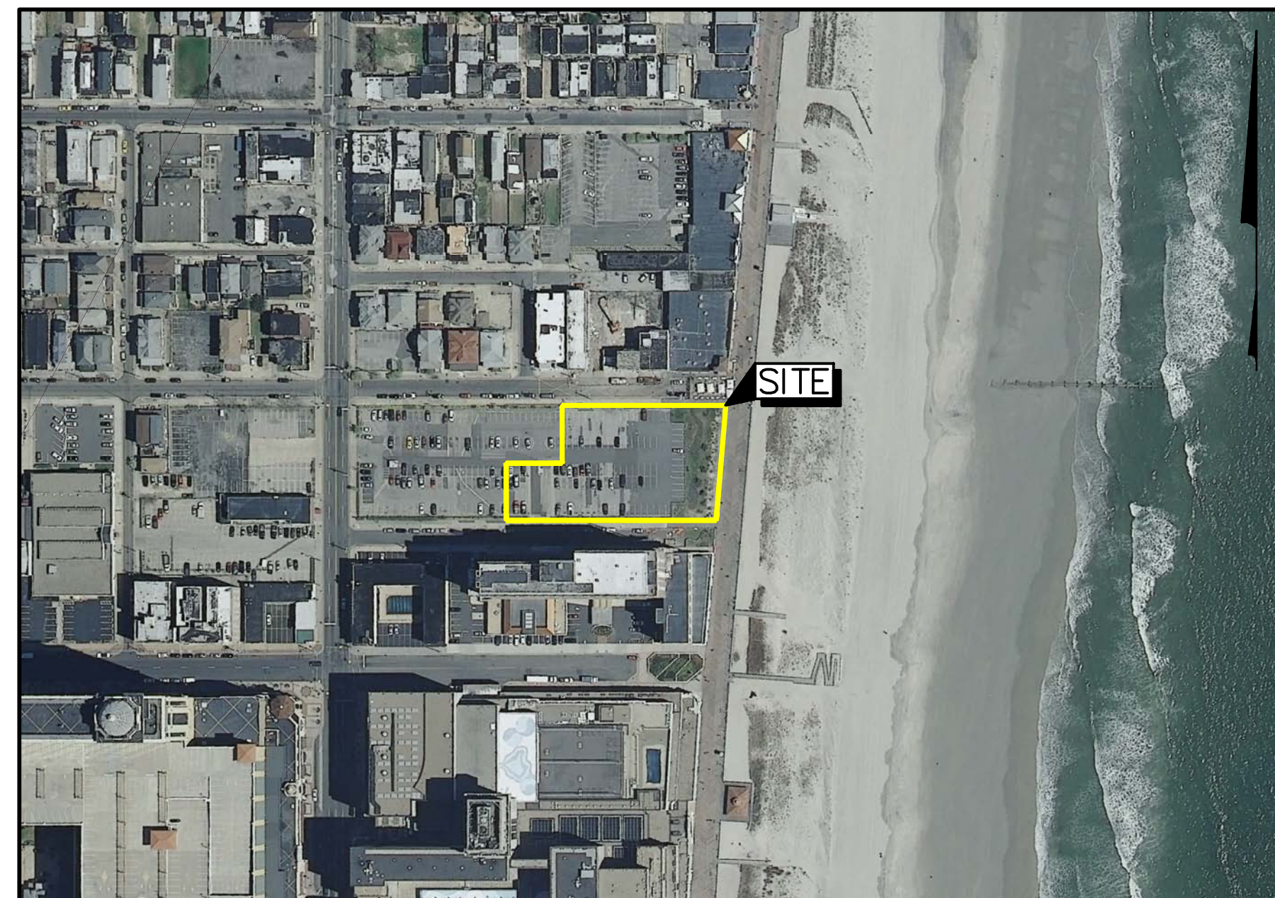
AERIAL MAP SCALE: 1" = 200'