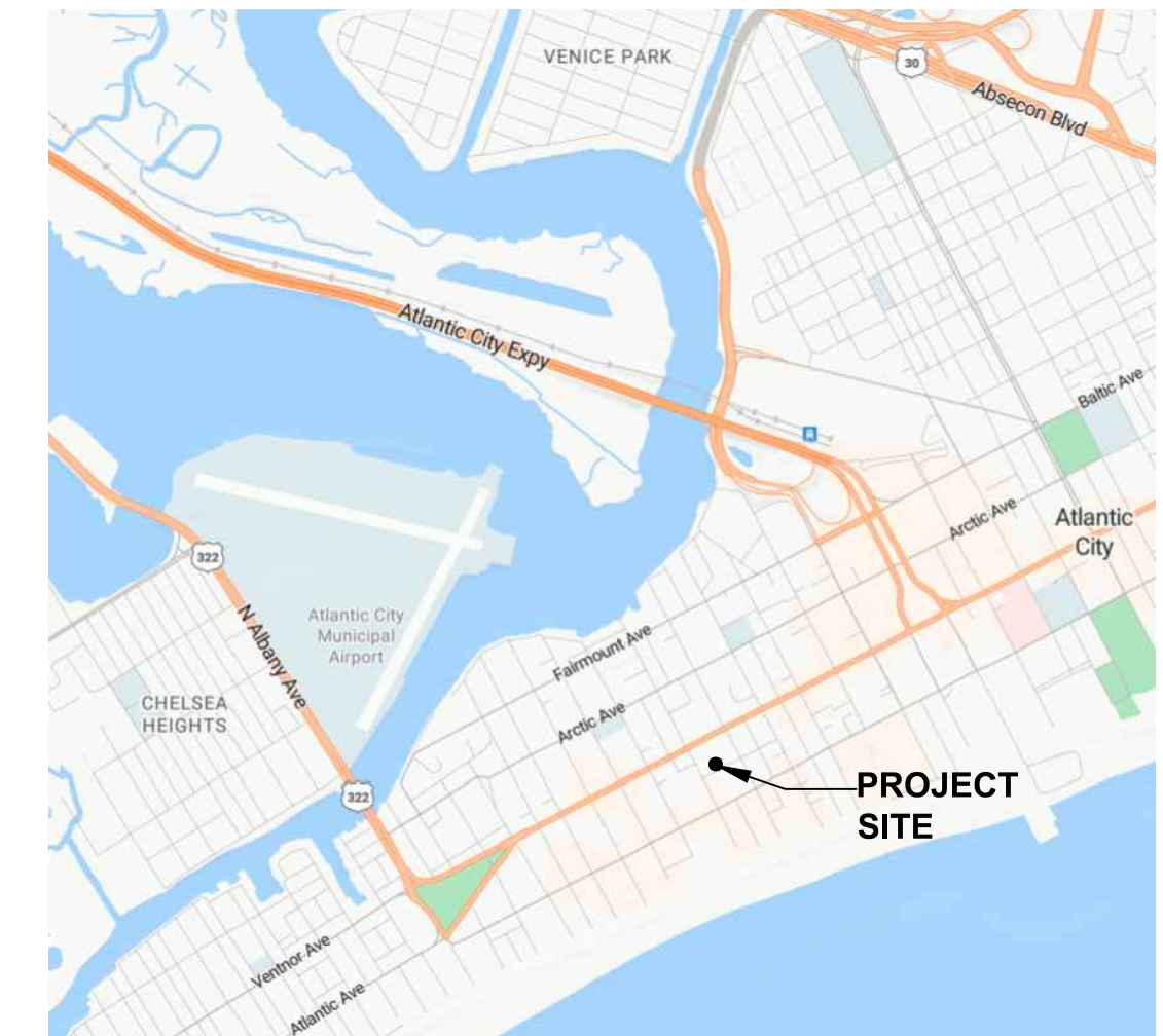
PROJECT LOCATION KEY