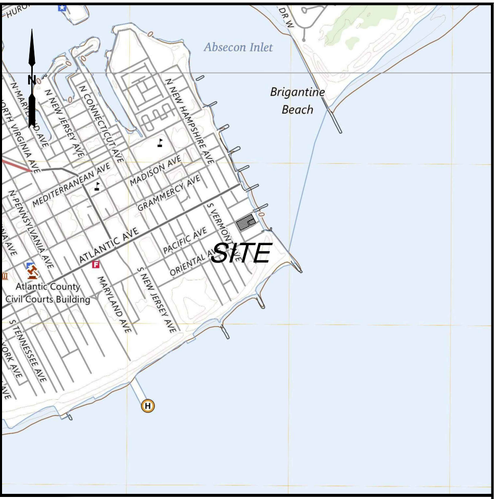
VICINITY MAP 1" = 2000'