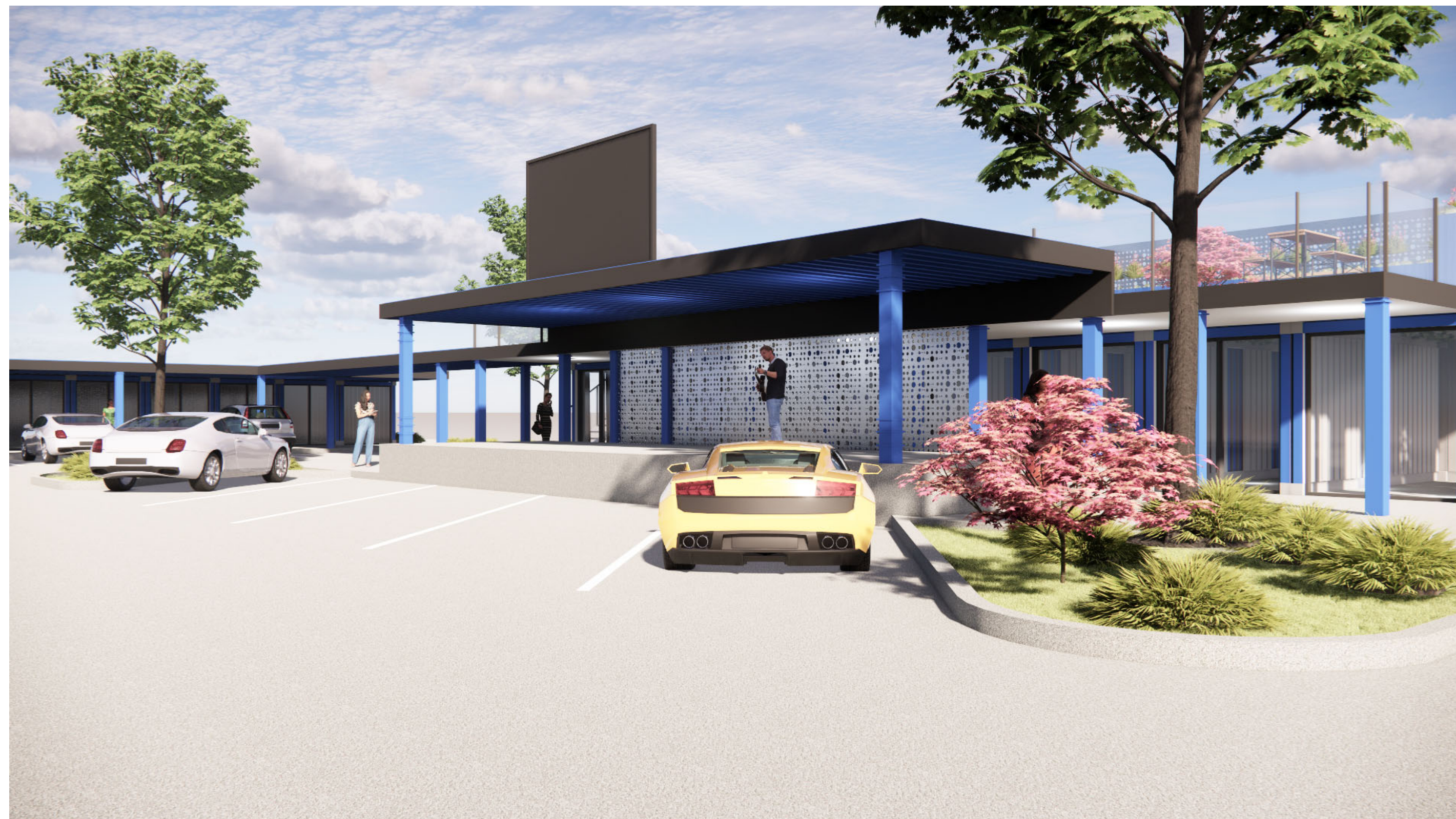
3) VIEW OF SATAGE