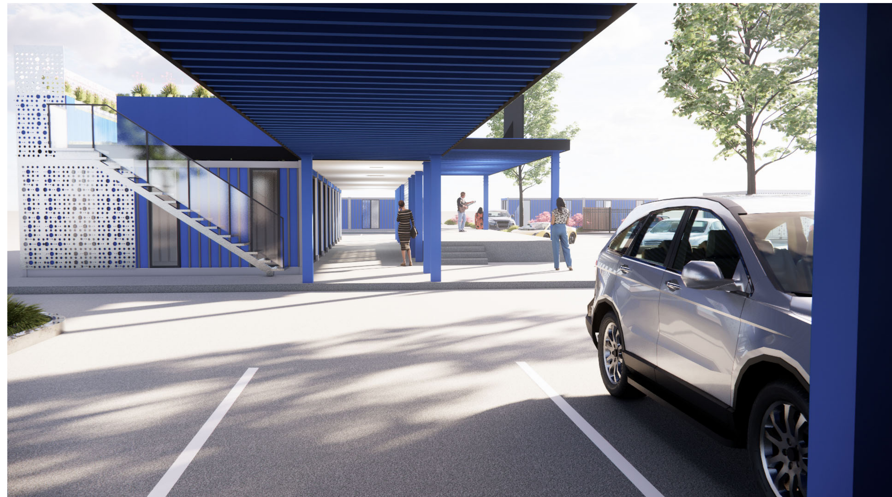
4) VIEW BEHIND STAGE

Antonio Scatena, AIA NJ A102618 NY 0317334 PA RA403928 Certificate of Authorization #AC000553