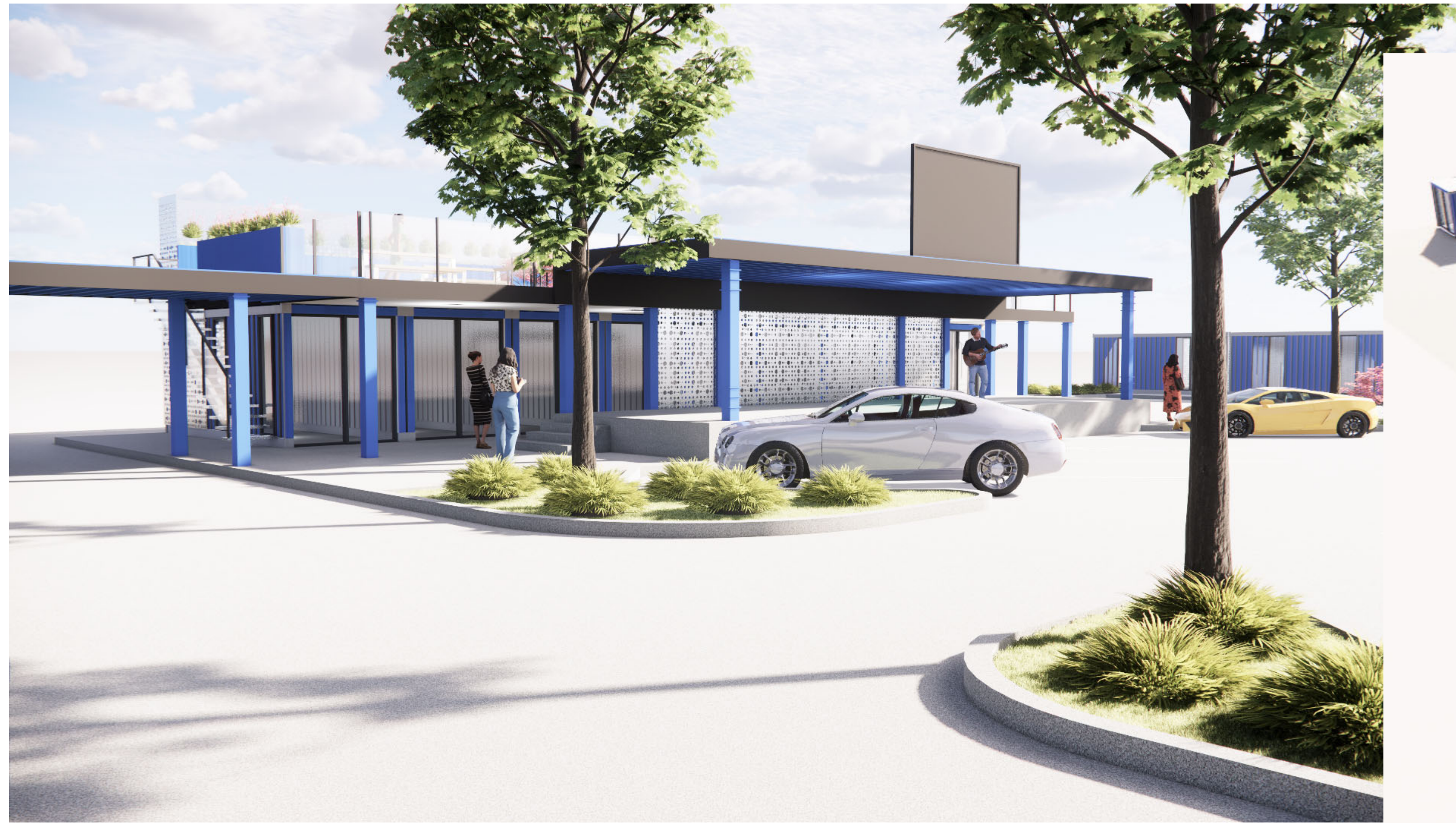
2) VIEW OF SATAGE