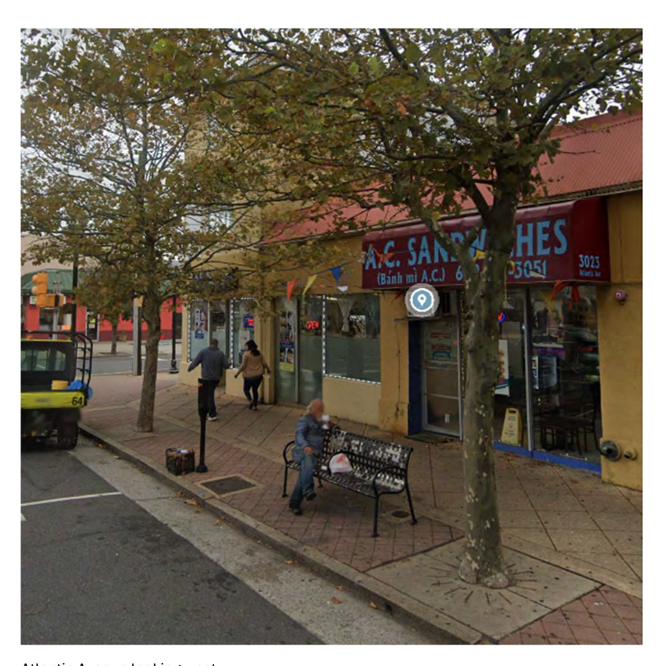
Atlantic Avenue looking west