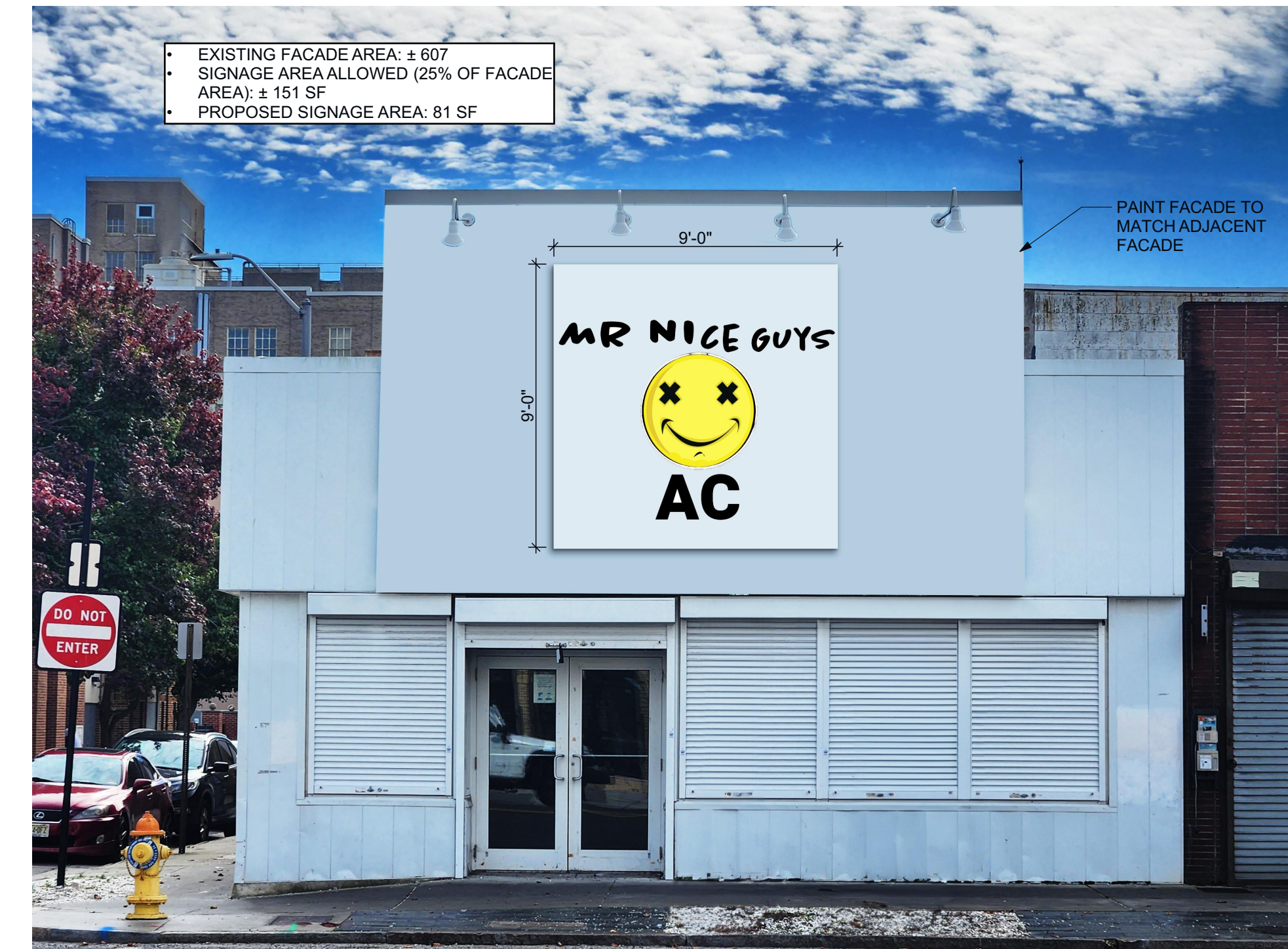
11 FRONT FACADE NOT TO SCALE