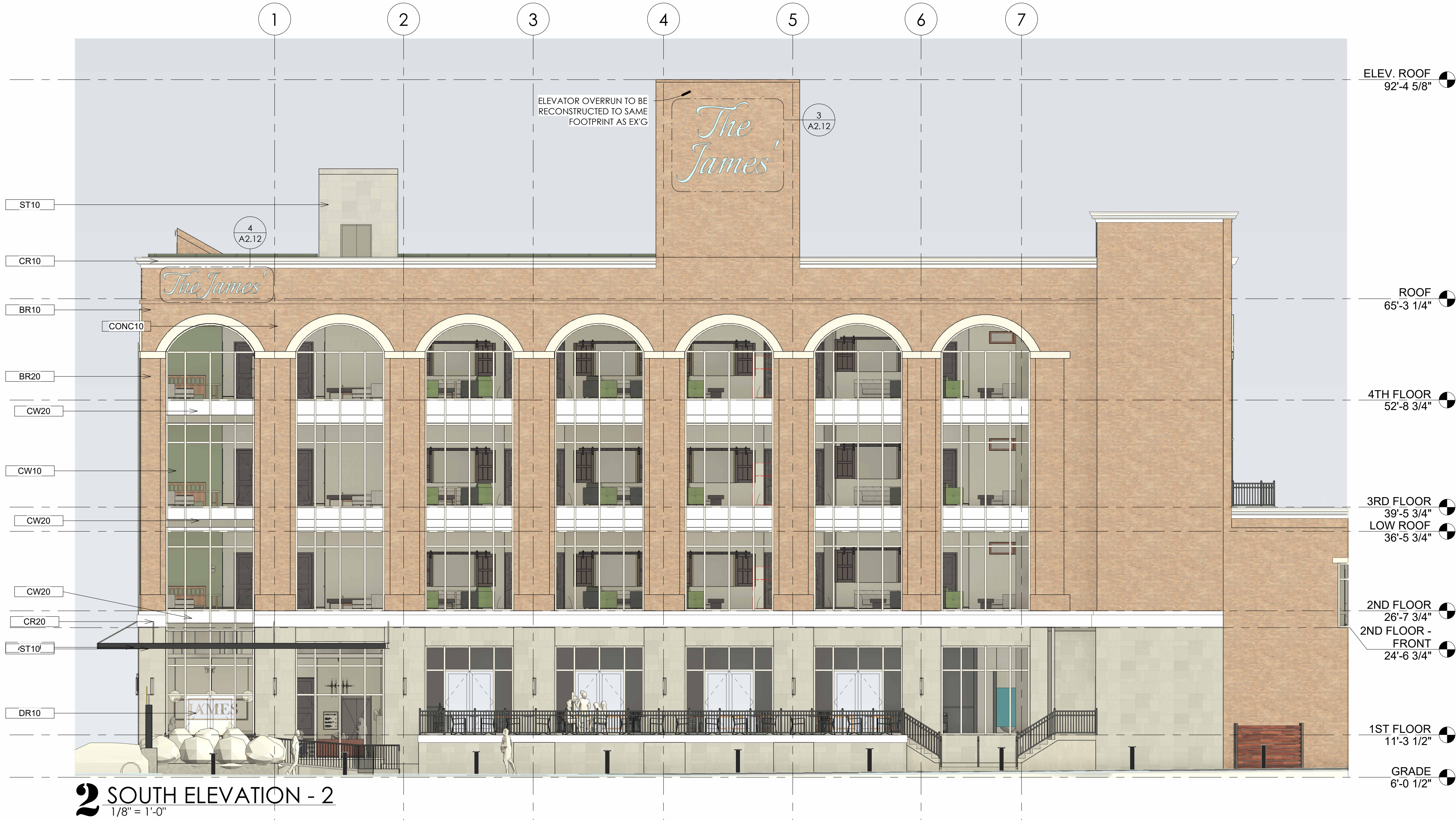
2 SOUTH ELEVATION - 2 1/8" = 1'-0"