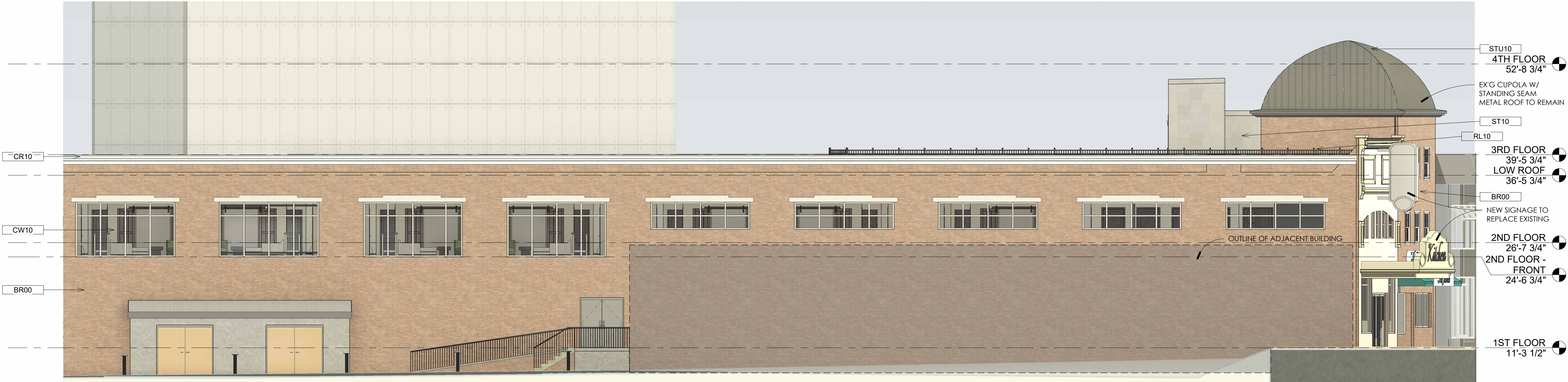
1 SOUTH ELEVATION - 1 1/8" = 1'-0"