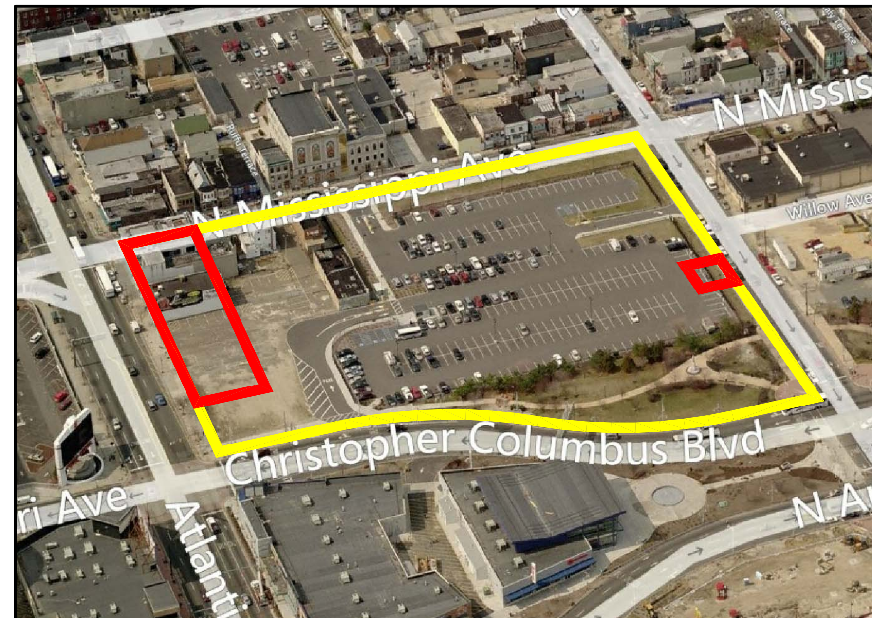
BIRD'S EYE PHOTO (LOOKING WEST)